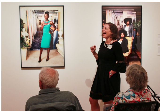
Figures 8. Museum discussions full of laughter.

Works of art often reference complex sociopolitical or cultural themes. Discussing these artworks is another form of respect for this audience. Rather than making assumptions about the ability of PWD to engage in critical discussions. Reflections tours invite meaningful exchange and diverse opinions. Intergenerational sharing of perspectives and life experiences happens between visitors, museum staff, and students in a way that rarely takes place in other museum interactions. Discussions are full of laughter, lively moments, and genuine curiosity (see Figure 8).