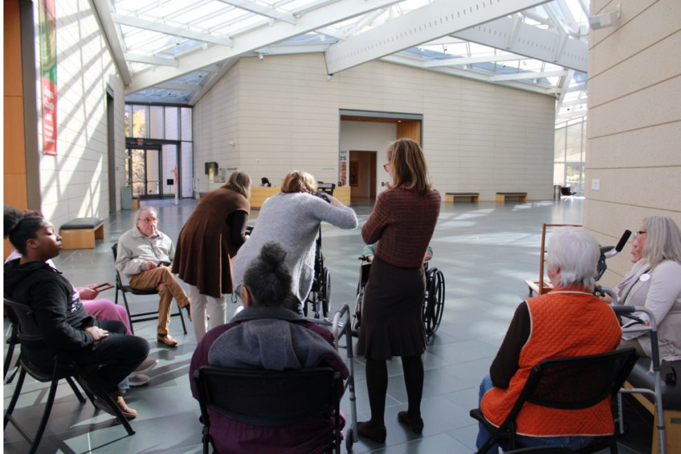
Figures 10. Photographing architectural details.

The following images depicts a tour which culminated in an interactive art-making activity. Past art activities include collages, watercolor painting, printmaking with stamps, and decorative crafts. Guides offer modifications to accommodate a range of abilities. During the tour depicted here, visitors photographed architectural details in the museum using Polaroid cameras (see Figure 10).