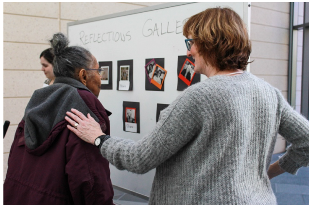
Figures 12. "Reflections Gallery" panel.