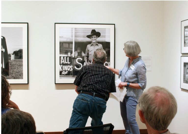
Figures 6. Museum guides lead visitor-driven discussions.

As tours move through the museum, discussions are visitor-driven, spontaneous, and unique to the group's specific combination of participants (see Figure 6). Guides are knowledgeable and intersperse art historical information such as the artist's background, historical context, and larger movements of the era throughout the discussion based on visitor interest (see Figure 7). However, any content shared is equal in value to participant observations. Valuing the viewers' perspectives and curiosities further strengthens the connection between guides and participants. Creating an environment in which the contributions of PWD are appreciated is important because such spaces are so often lacking as individuals grow older and experience memory loss.