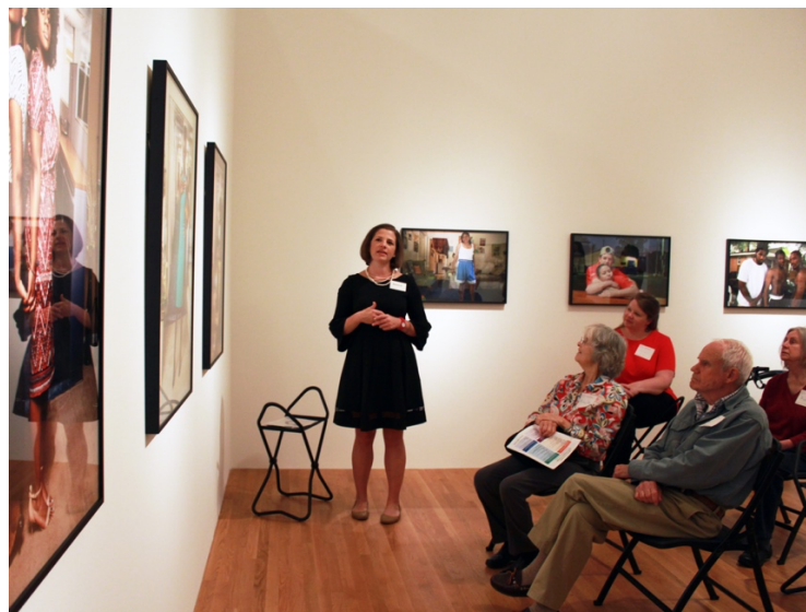
Figures 7. Museum guides share information on art contexts.

As tours move through the museum, discussions are visitor-driven, spontaneous, and unique to the group's specific combination of participants (see Figure 6). Guides are knowledgeable and intersperse art historical information such as the artist's background, historical context, and larger movements of the era throughout the discussion based on visitor interest (see Figure 7). However, any content shared is equal in value to participant observations. Valuing the viewers' perspectives and curiosities further strengthens the connection between guides and participants. Creating an environment in which the contributions of PWD are appreciated is important because such spaces are so often lacking as individuals grow older and experience memory loss.