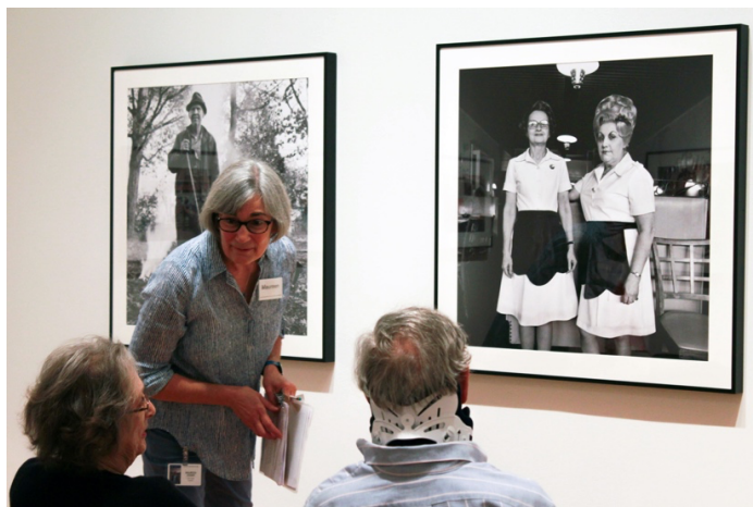
Figures 4 & 5. Museum guides leading guided tours.