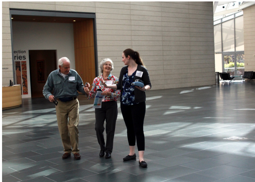
Figure 3. Museum staff incorporates nametags into social period.

After this socialization period, guides lead the group into the galleries to begin the 90-minute guided experience (see Figures 4 & 5). Designed to be conversational, the tours examine three or four artworks in the museum's temporary and permanent exhibitions. Guides intentionally structure their questions in the galleries to encourage discussion. For example, guides ask open-ended, observation-based questions with no correct answers, rather than questions relying on memory or learned facts which may lead to frustration. The guides also allow an extended silence after asking a question, giving PWD the time they may need to formulate and communicate a response. Deliberately controlling the pace of the tour can make it more accessible to PWD.