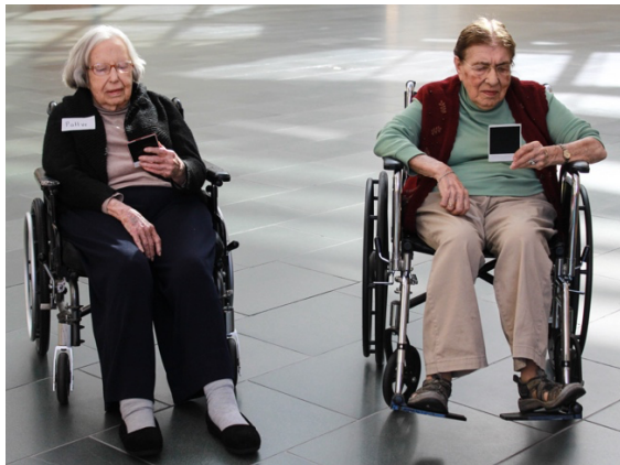
Figures 11. Photographing architecture.

Working in pairs, participants selected a detail to photograph, framed their image, and titled the photograph (see Figure 11). The activity concluded with participants' images displayed on a temporary "Reflections Gallery" panel (see Figure 12).