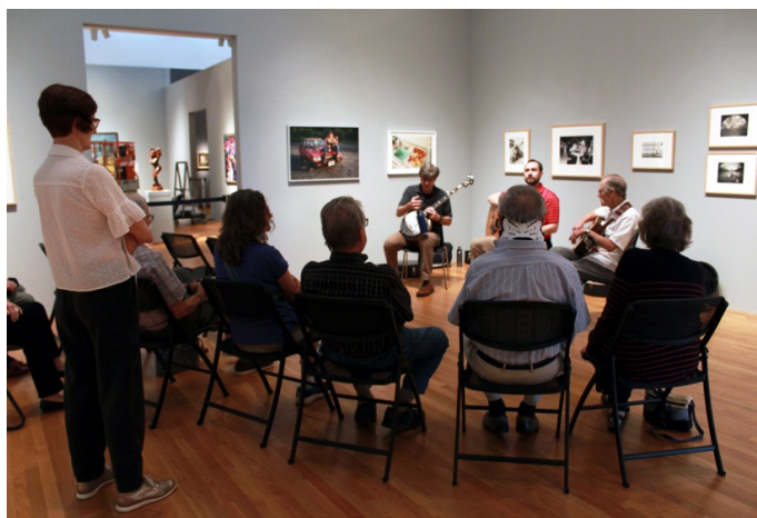
Figures 9. Live music in the galleries.

Beyond looking at artwork, half of the tours conclude with live music in the galleries and the other half end with an art-making activity (see Figure 9). The following image highlights the live music component of the program, with a performance from a local bluegrass trio who have played repeatedly for Reflections. Other music groups have spanned a variety of genres, including jazz, hip-hop, and classical. The musicians are hired by the museum and work with staff in advance to coordinate their song selections with the tour's featured artwork.